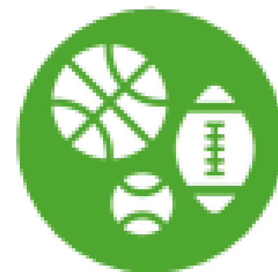
Recreation / Parks