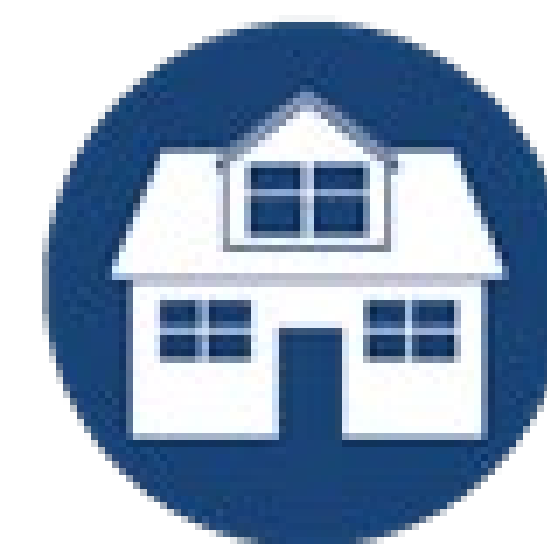
Housing / Residential