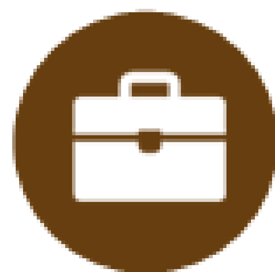
Commercial / Office